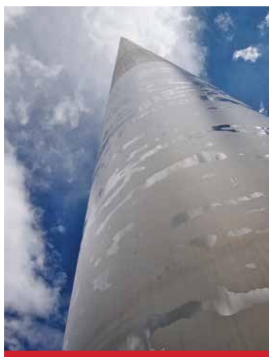
The Dublin Spire – a stunning example of our surface texturing technique showing the versatility of controlled shot peening