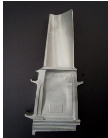
7EA type buckets

Our Center for Advanced Coatings offers customers superior thermal spray process capabilities. It is designed for applications development, parameter studies, coatings qualification and prototype work. Our experts work directly with customers to diagnose problems and devise solutions. We can fully quantify coatings by analyzing composition and evaluating structure.