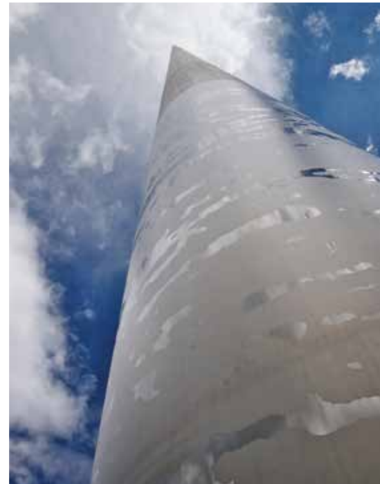
The Dublin Spire – a stunning example of our surface texturing technique showing the versatility of controlled shot peening

Tailoring our services to meet your needs