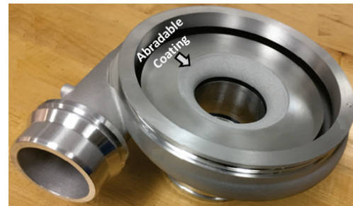
Innovative abradable coating on the aluminum compressor case applied by CWST proprietary material, microstructural design and process