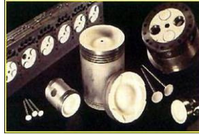
Typical Components coated with Thermal Barrier Coating (TBC)