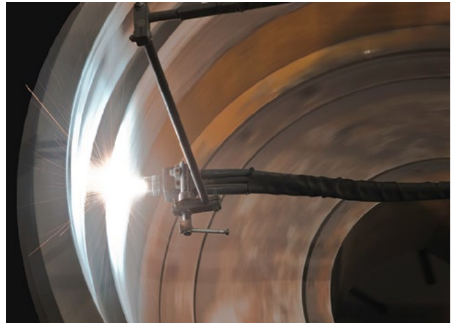
Arc Spraying on ID of Large Housing

Aerospace engine applications include hot and cold section components such as vanes, combustion liners, turbine shrouds, casings, knife edge seals, blades, and complex geometry blisks. Dimensional restoration of rotating journals and electrical run out journals can also be accomplished by thermal spray coatings.