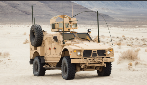
MILITARY: CARC COATING