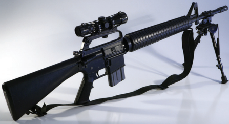
FIREARMS: PHOSPHATE COATINGS